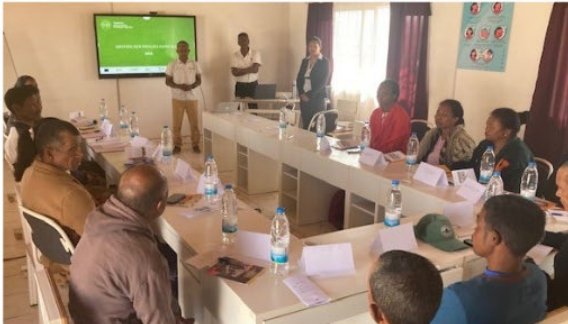
Workshops held by the Rural Training Center CAFPA of Antsirabe (Madagascar)