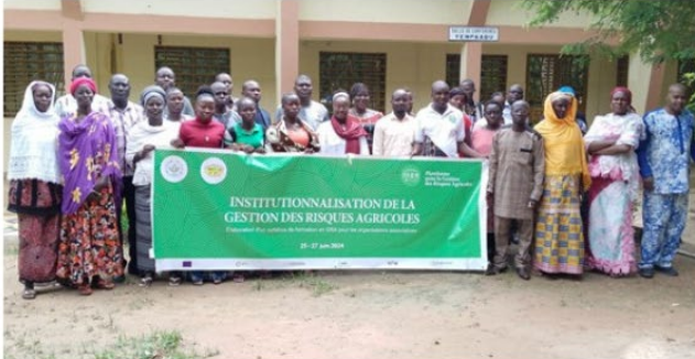
Workshop held by the women-led farmers organisation "Tin Buaba" (Burkina Faso)