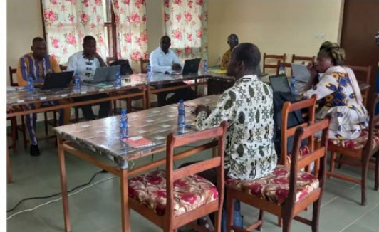
Workshop held by the University of Nazi Boni (Burkina Faso)